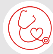
DISEASE PREVENTION AND TREATMENT