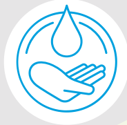
WATER, SANITATION, AND HYGIENE