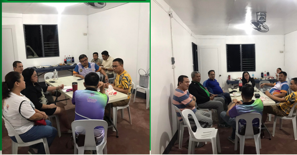
Previous Meeting RCSF hub.