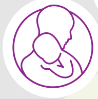
MATERNAL AND CHILD HEALTH