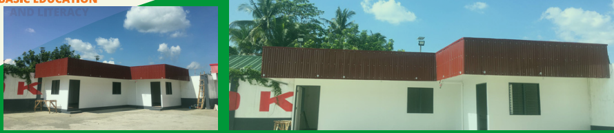
Newly Constructed meeting place of RCSF.