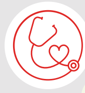
DISEASE PREVENTION AND TREATMENT