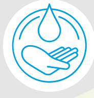
WATER, SANITATION, AND HYGIENE