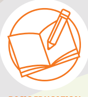
BASIC EDUCATION AND LITERACY