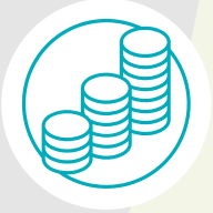
COMMUNITY ECONOMIC DEVELOPMENT