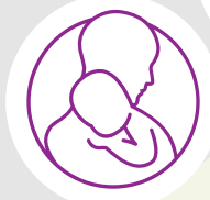
MATERNAL AND CHILD HEALTH