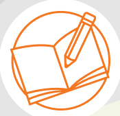
BASIC EDUCATION AND LITERACY